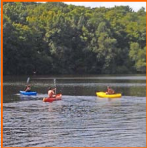
Kayaking The Lake