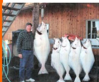
Nostalgic photos See Page 6