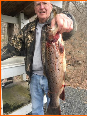
Fish caught in lake

Help Wanted We are Currently looking for someone to Chair the Kid's Fishing Derby. If you are Interested Please contact Brian Hetherly at 845-883-6877 or 2002hd@optonline.net Free Training