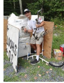
Long Distance Shot