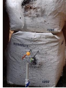
Floating Marshmallow Challenge