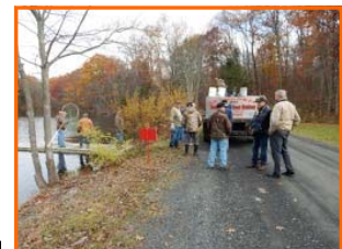
11/8/17 Fish Stocking

Steel Plate schedule Steel Plate schedule Jan Feb March April 2018 I'll be in Arizona until April 15th plates can be used as long as a RSO is present. If no RSO is present set up a target stand and frame to shoot paper. Jan 31st Feb 14th & 28th March 14th & 28th April 11TH & 25th Thanks Bob Vogel Sr 845 206 6784