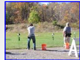
BRGC Trap Championship October, 2017