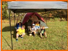
Cub Scouts October 2017