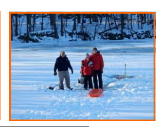
Ice fishing on the lake