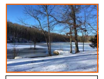
Outside view of property