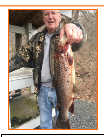
Fish caught in lake