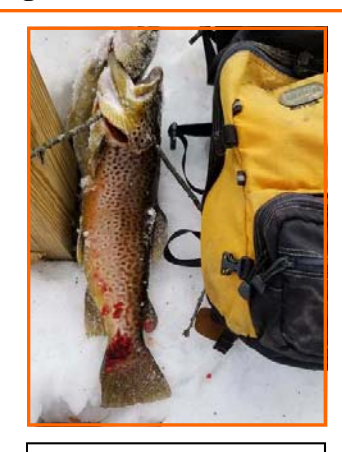
Ed Rose catches a brown trout