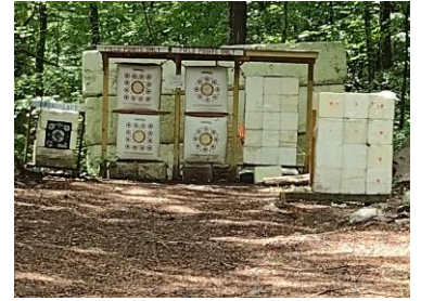
2023 ARCHERY RANGE

The archery range is now set up to accommodate 5-6 shooters on the line, as you can see with the youth archery team picture. There is an intermediate target which is easily moveable to accommodate shooters shooting at different distances from the same shooting line. The bag targets are rated for crossbow and there is a separate target for broadhead arrows, help you get ready for hunting season. The range is measured out to 60 yards. THANK YOU to everyone that helped to make the range what it is today, it could not have happened without your support. A member asked if it would be possible to have a movable target that can be used outside of the archery range, due to mosquitos. It is a work in progress.