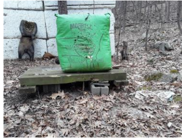
2019 ARCHERY RANGE