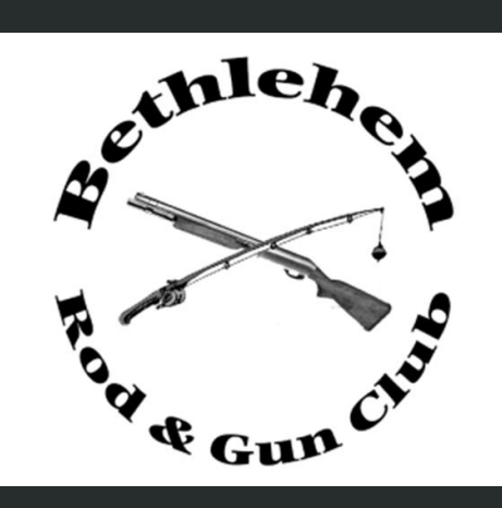
Trout Stocking Nov 17<sup>th</sup>, 2023