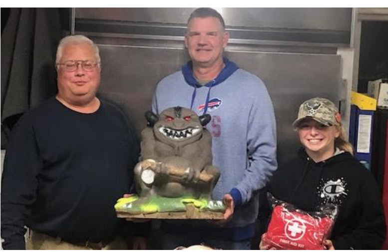
Archery winners from last fall. Congrats!